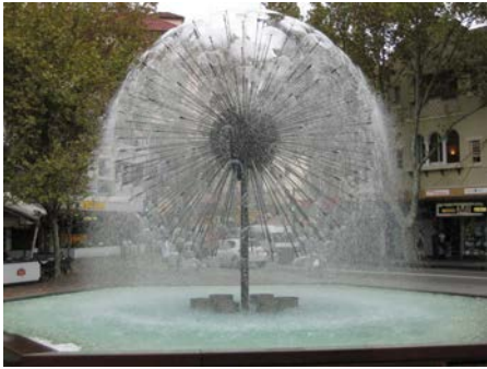
Kings Cross's El Alamein Memorial Fountain UNSW