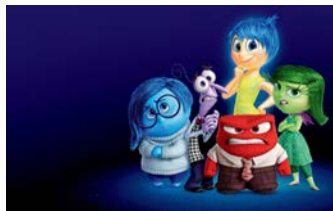
Still from film Inside Out

For further details visit Sutherland Shire Council website .