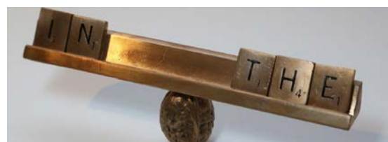
UNSW Galleries, Will French, All (tbc), 2015, bronze cast and enamel, 17.5 x 6 x 3cm. ©Will French/Licensed by Viscopy. Photo: Tim Levy.