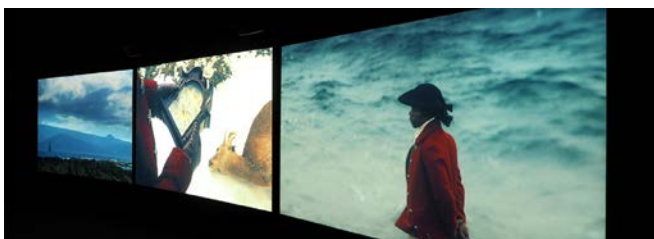
UNSW Galleries, Troubled Waters suite. John Akomfrah, Vertigo Sea, 2015, 3-channel HD video installation, 7.1 sound, 52 mins.

Not a Friends of Hazelhurst Member? Join now to enjoy this event and BOOK EARLY so as not to miss out!