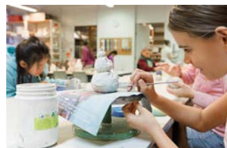
Kids clay workshop

A wide range of creative art classes tailored for children aged 6 – 13 years. Includes clay work, drawing & painting, ink & collage work plus much more! Full details available on the website. Enrolling now.