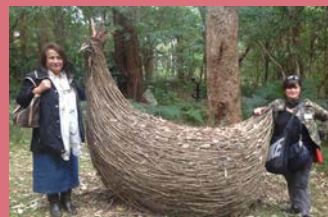
'Friends' with 'Henrietta', made from steel, chicken mesh & sticks