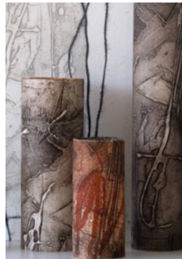
Detail of 'Totems VI' by Laura Stark. 60 (H) x 120 (W) x 30 (D) cm. Collagraph, Photopolymer Intaglio and Monotype on paper

Laura reinterprets the environment through three dimensional qualities of paper, whether as textual embossment 3D forms, or free flowing shapes.